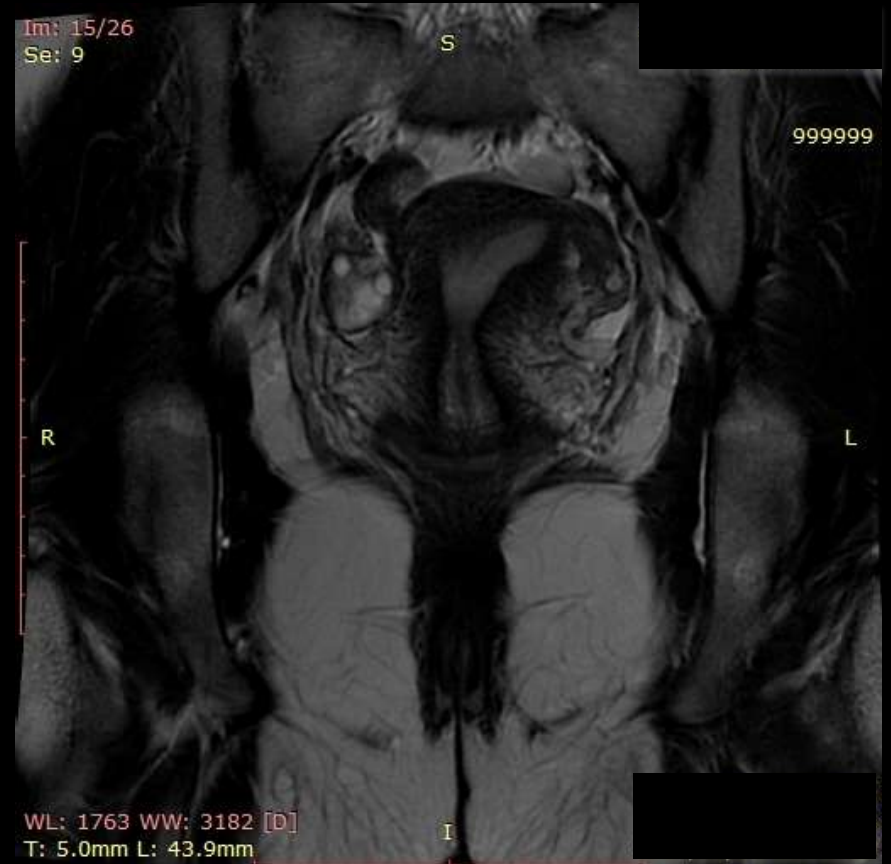
MRI T2WI 冠状断