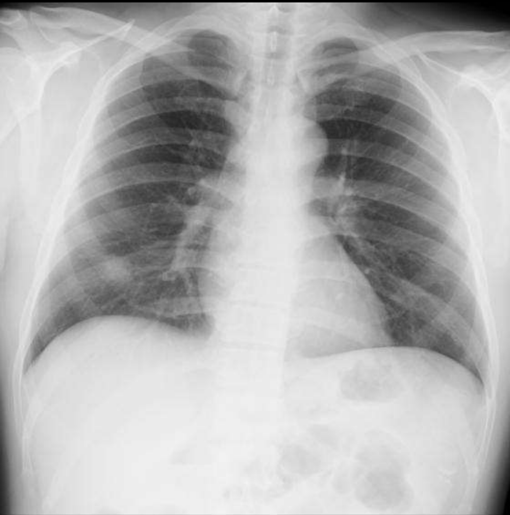
初診時 胸部X線単純撮影 2方向